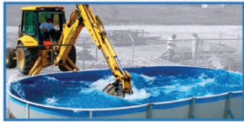
A vigorous backhoe test is performed prior to the launch of each new pool.

The Engineering design of the Channel-Lok II buttress system has been developed to require fewer buttresses without compromising its strength and reliability. Along with Atlantic's unique structural system and fewer buttresses, the Channel-Lok II buttress system will be appreciated for its good looks and ease of installation. This buttress system can be installed on a flat concrete surface. There is no excavation or digging needed on a flat compacted level surface.